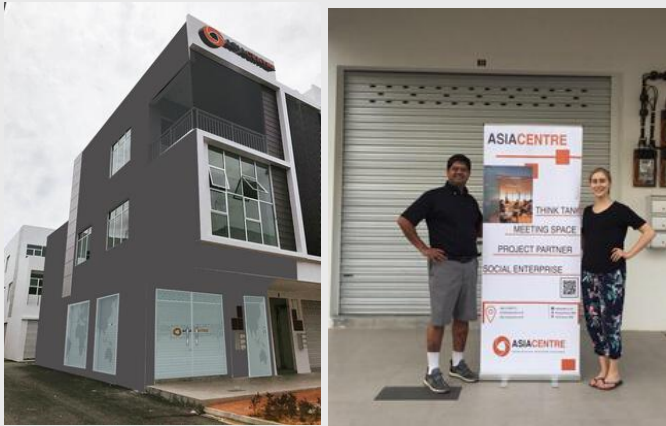
Asia Centre's Malaysian premises

Asia Centre has initiated plans to establish a second branch in Johor Bahru, Malaysia. The new branch will complement and extend the reach of programmes currently organized by Asia Centre Thailand in Bangkok. Johor Bahru was selected as the preferred location for the Centre's second branch because of its strategic location, 330 kilometers from Kuala Lumpur and 18 kilometers from Singapore's Second Link Bridge.