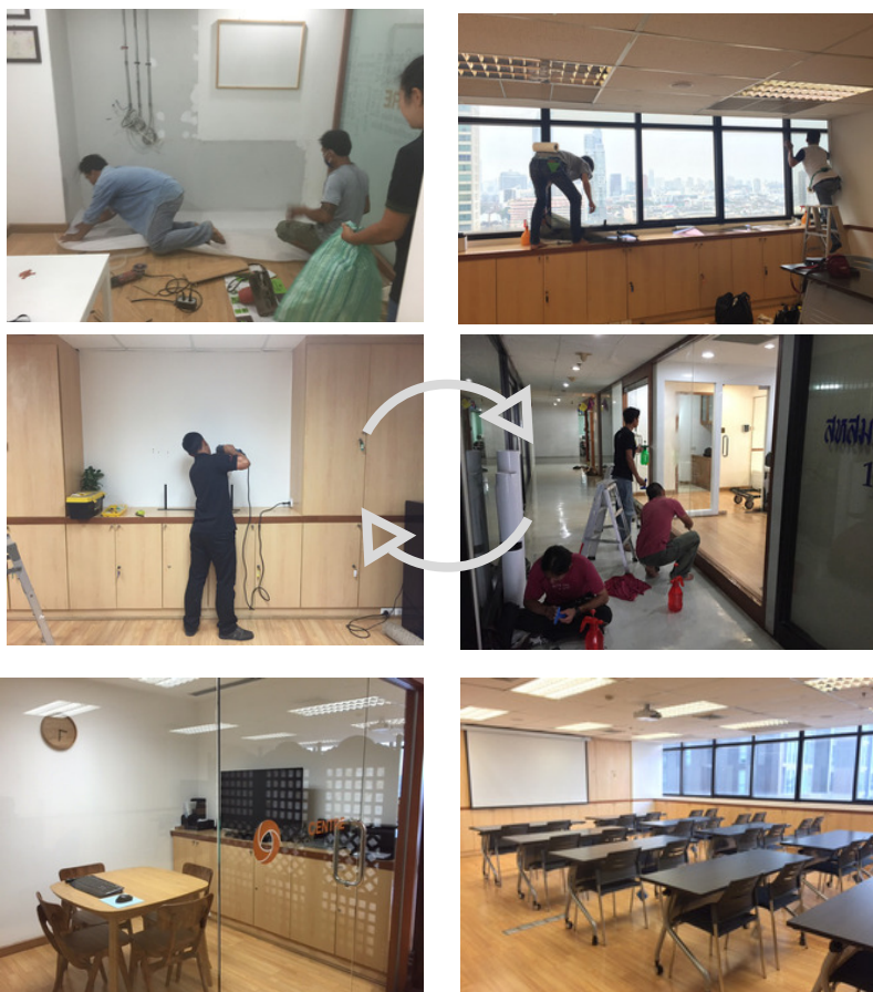
Creating the Asia Centre space

The Asia Centre project began with the acquisition of a 120 sqm office space next to Phayathai BTS Station and Airport Link in central Bangkok. This was followed with by the renovation and setting up the physical premises of the Centre including the purchase and installation of furniture and fittings.